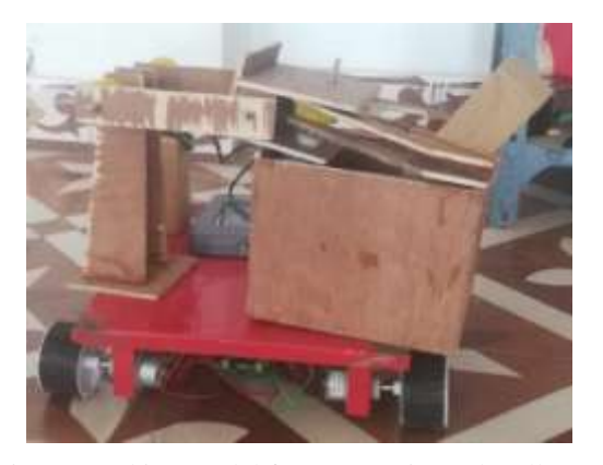
Fig.2. Working model for Automatic trash collector

Figure 2 represents the Working model of our project work. The robot is started to move by tracing the black line using IR sensor. The camera is allowed continuously to take pictures. The dustbin is detected by comparing the image taken by the camera with the default image. If the dustbin is detected the robot stops moving and the robotic arm with the help of gripper picks up the dustbin and transfers the wastes automatically into the container. The process is repeated till the black line ends. Once the black line ends the robot stops moving further.